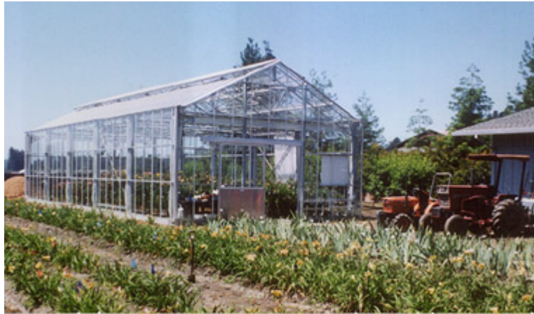
Greenhouse installed 2002