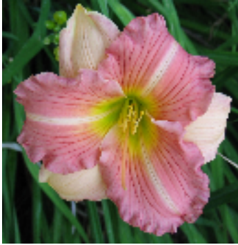
H. China Bride